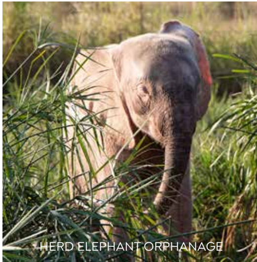
HERD ELEPHANT ORPHANAGE